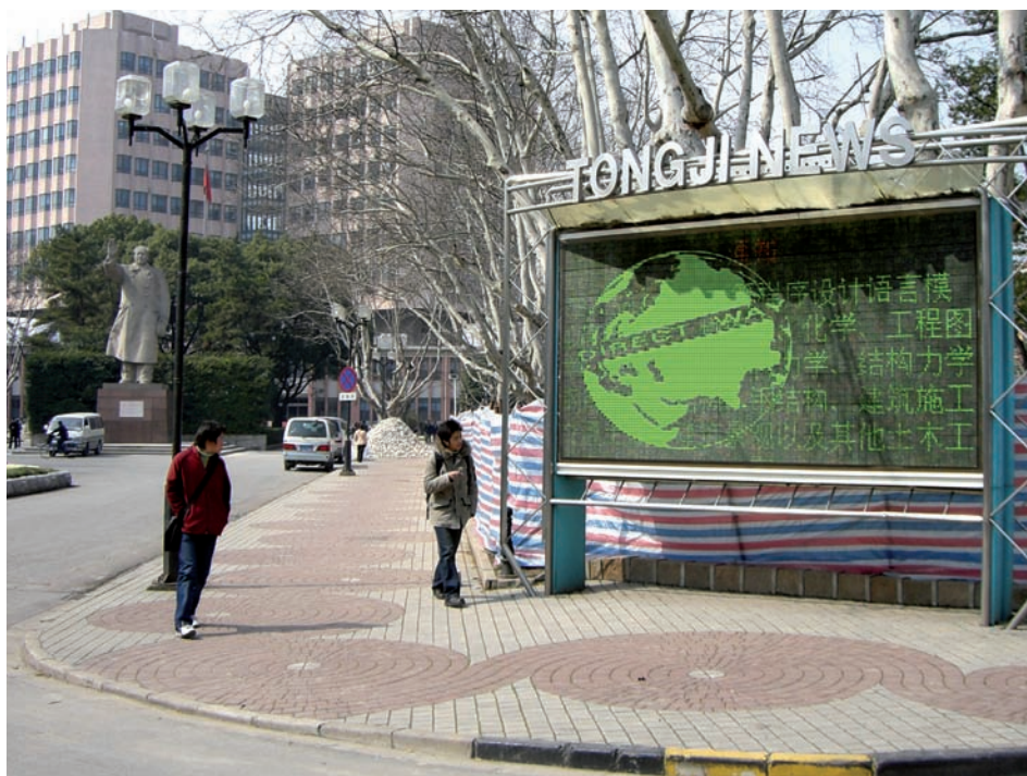
Infoscreen on Tongji campus Shanghai